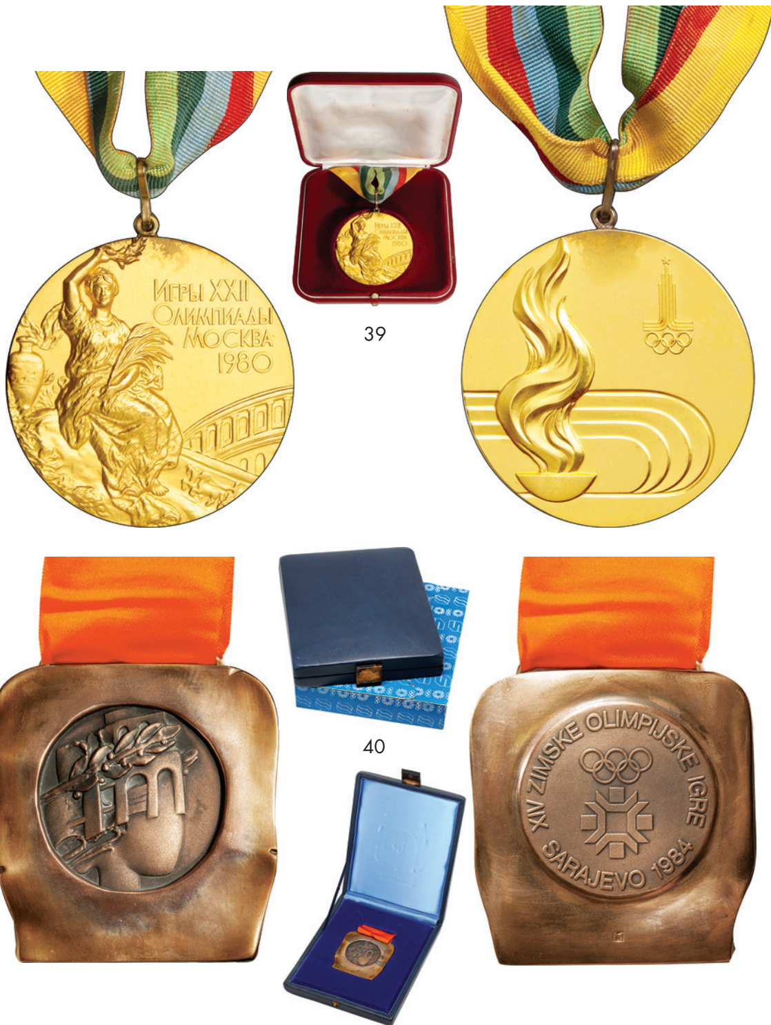
39. Moscow 1980. Gold First Place Winner's Medal Awarded for Athletics. Goldplated silver, 60mm, by Ilya Postol. Victory seated with laurel and palm branch, Colosseum stadium in Rome in background. Rev. Olympic flame over stadium, Moscow logo in upper right. With multi-color ribbon, housed in red plastic case with gold logo, hairline crack on top. Medal EF. ($9,000)