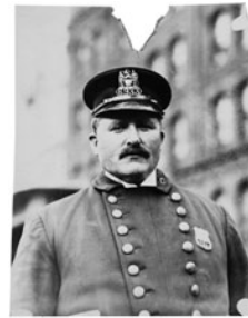
Part of 276