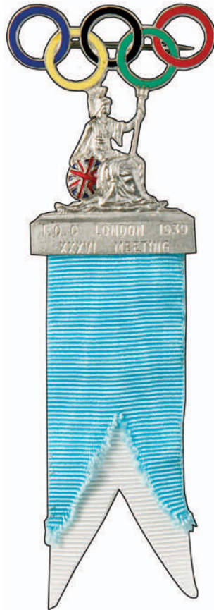
Lot 4 38th IOC Session in London Badge, 1939